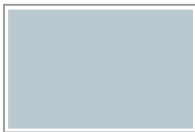
2 PAGE SPREAD